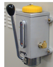
Optional EvenFlow™ reservoir and pump