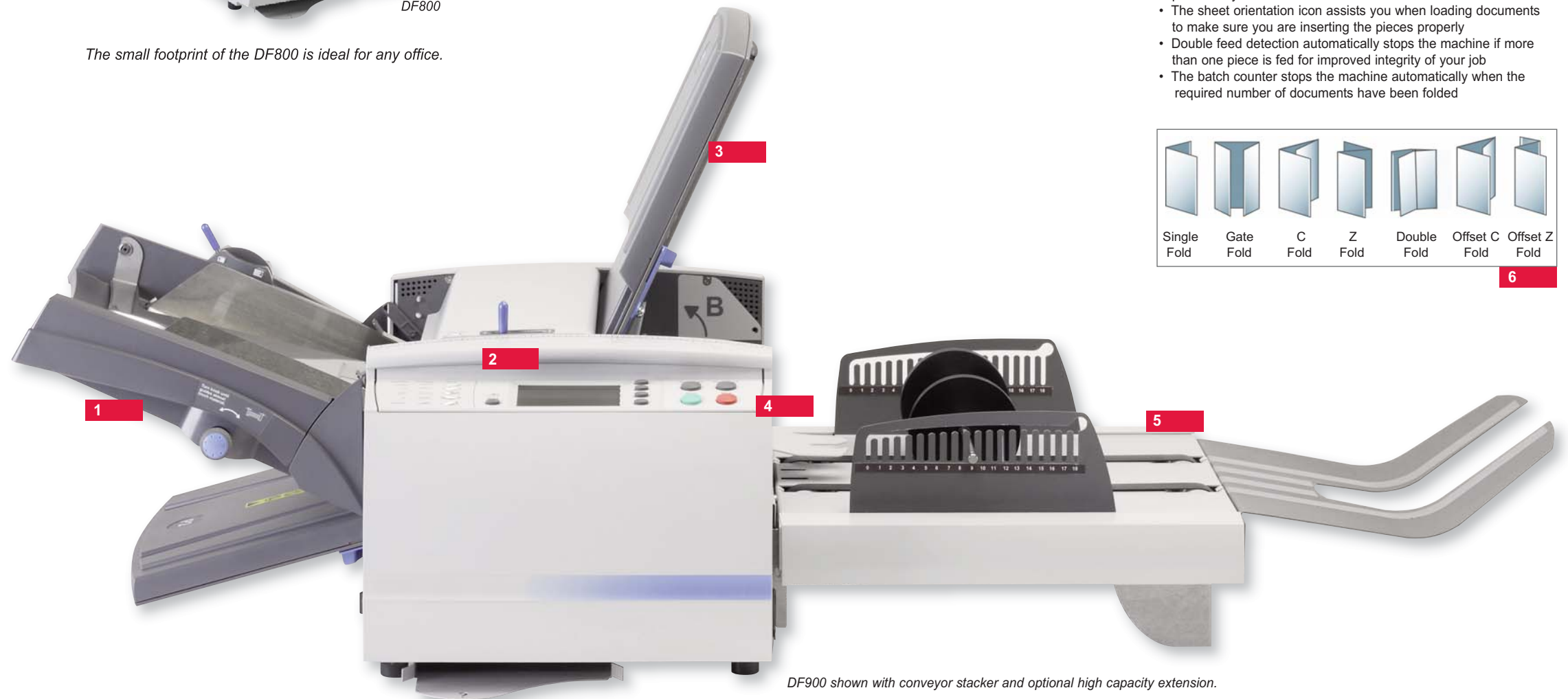
DF900 shown with conveyor stacker and optional high capacity extension.