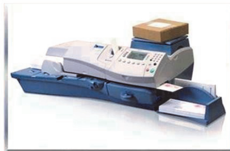
Simple & Cost-Effective Autofeed & WOW™ DP Systems for Low to Mid-Volume Mailers