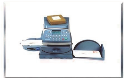
Simple & Cost-Effective Manual DP Systems for Low-Volume Mailers