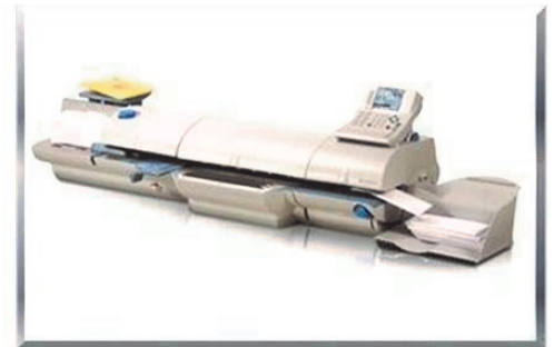
DP Intellilink™ Series Weigh-On-The-Way™ Systems for Mid-Volume Mailers