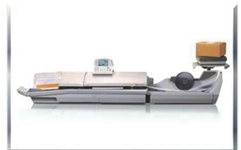
Green Alternative Series Factory Certified Digital Mailing Solutions