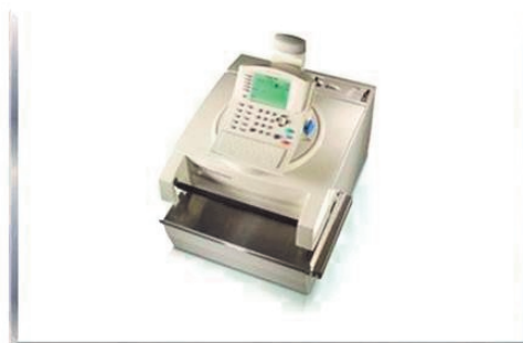
DP Infinity™ Series Digital High-Volume Metering on Production Inserting Systems