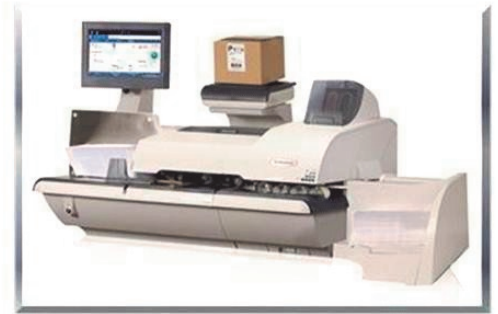
Connect+™ Series Full-Color Web-Based Solutions for Mid-Volume Mailers