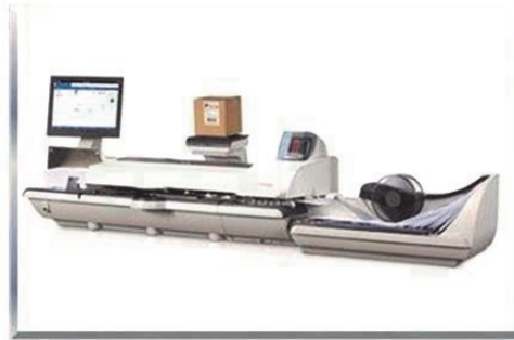
Connect+™ Series Full-Color Web-Based Solutions for High-Volume Mailers

Learn more about our extensive prod- uct-offering at www.SGLLC.net .