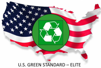
U.S. GREEN STANDARD – ELITE

Streamline Group Fairview Technology Ctr. 11020 Solway School Rd Suite 101 Knoxville, TN 37931 Phone: (865) 622-9212 Fax: (865) 862-8989 Email: info@SGLLC.net Web: www.SGLLC.net